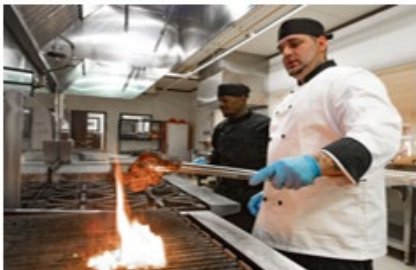
Camp Catering and Operations