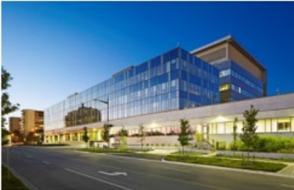
Forensics Services and Coroner’s Complex, Toronto, ON

Support Services employed 8,148 people at the end of 2025.