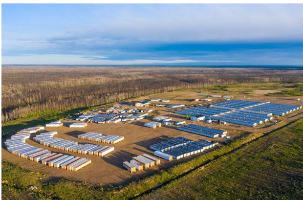
Workforce Accommodation Structures

Within ABS, during 2025, one customer contributed greater than 10% of revenue. ABS employed 235 people at the end of 2025.