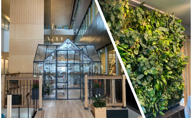
Indigenous Youth, OYEP Manitoba, Celebrating 25 years Butterfly conservatory and living wall at client site

More information on Dexterra’s ESG activities can be found in the 2025 Sustainability report, available at the Corporation’s website ( dexterra.com ).