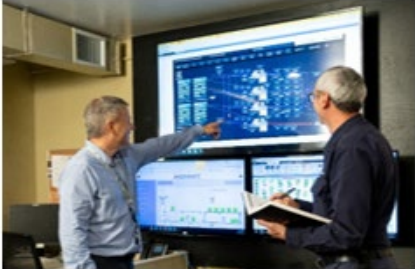
Space and Infrastructure Solutions